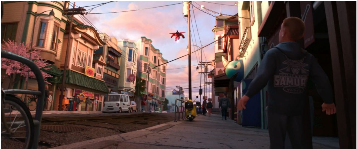
Fig. 7. "Street in Big Hero 6 ." Walt Disney Animation Studios, 2014. Author's screenshot.