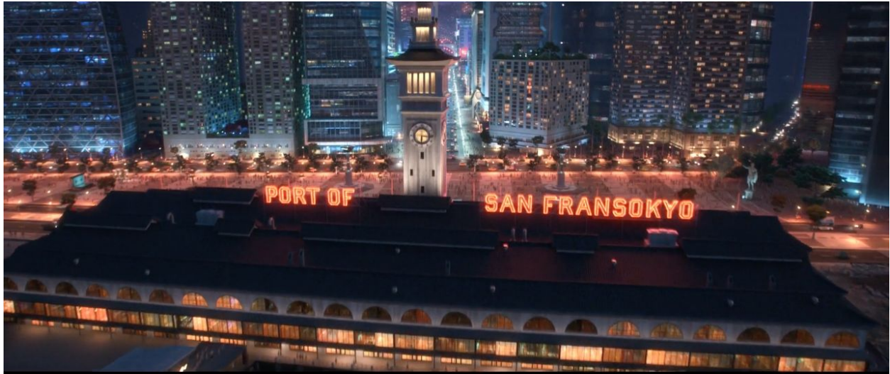
Fig. 8. “Urban Lighting.” Walt Disney Animation Studios, 2014.