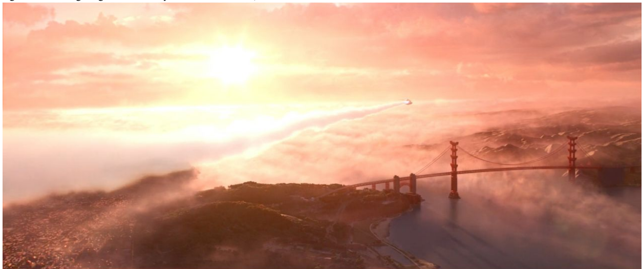
Fig. 9. “Natural Lighting.” Walt Disney Animation Studios, 2014. Author’s screenshot.