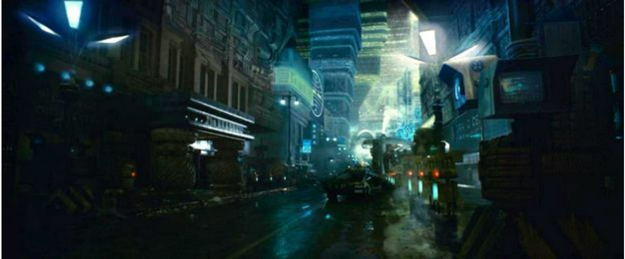
Fig. 6. "Street in Blade Runner ." Stillsfromfilms.wordpress.com . Warner Bros. Studio, 1982. Screenshot. 3 August 2013.