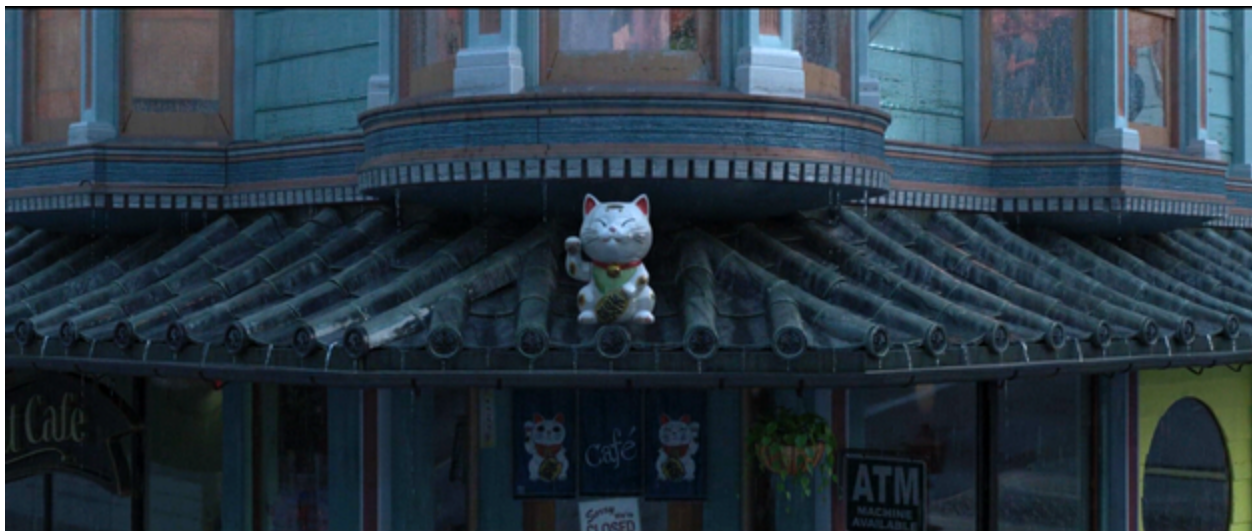
Fig. 1. “Lucky Cat Figure on Victorian House.” Walt Disney Animation Studios, 2014.