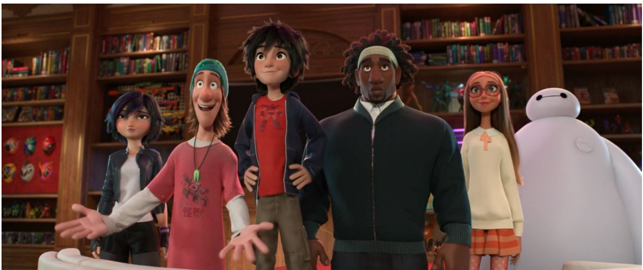
Fig. 15 "Big Hero 6 Team." Walt Disney Animation Studios, 2014. Author's screenshot.