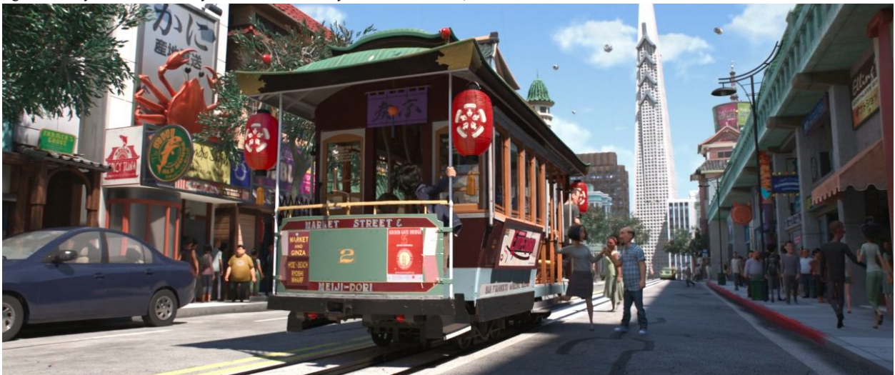
Fig. 3. "Japanese Lanterns on Cable Cars." Walt Disney Animation Studios, 2014.