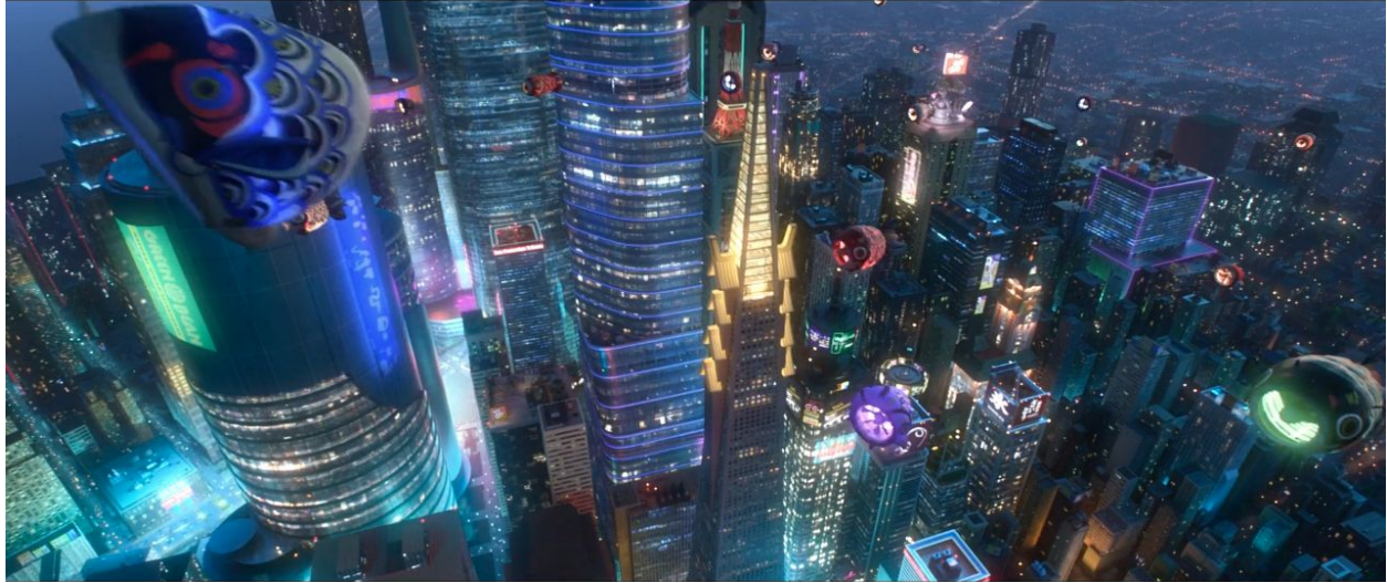
Fig. 5. “Koinobori Wind Turbines and Skyscrapers.” Walt Disney Animation Studios, 2014.