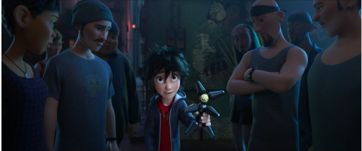
Fig. 11. "Hiro as Guileless Kid." Walt Disney Animation Studios, 2014. Author's screenshot.