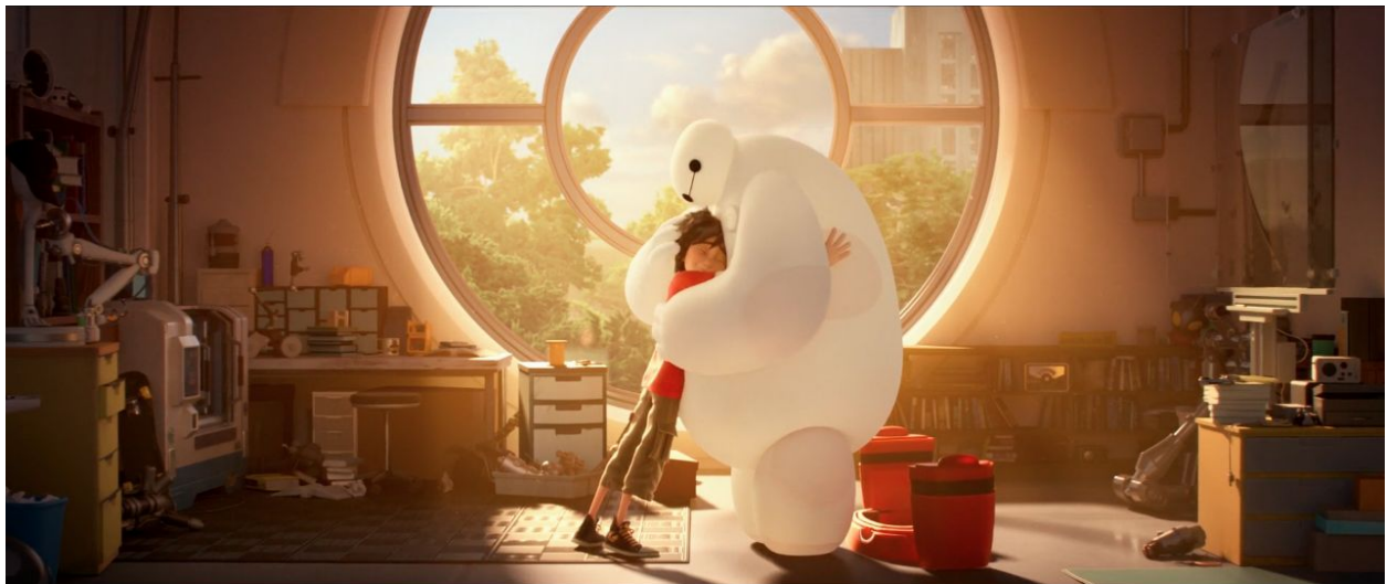
Fig. 10. "Utopian Hybrid Friendship." Walt Disney Animation Studios, 2014.