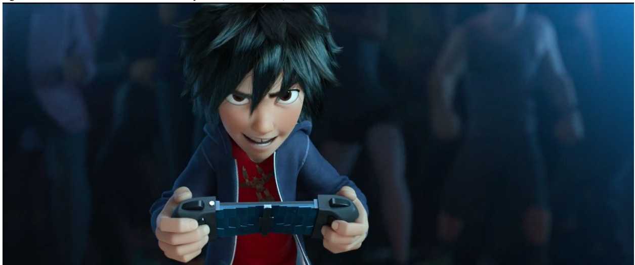
Fig. 12. "Hiro as Con-Man." Walt Disney Animation Studios, 2014. Author's screenshot.