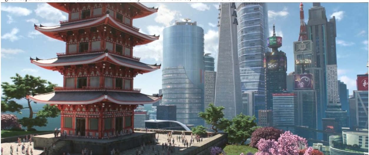
Fig. 4. "Pagoda Near Krei Tech." Walt Disney Animation Studios, 2014. Author's screenshot.