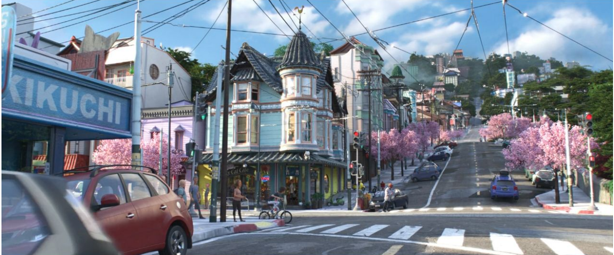
Fig. 2. "Cherry Blossoms on Hilly Streets." Walt Disney Animation Studios, 2014. Author's screenshot.