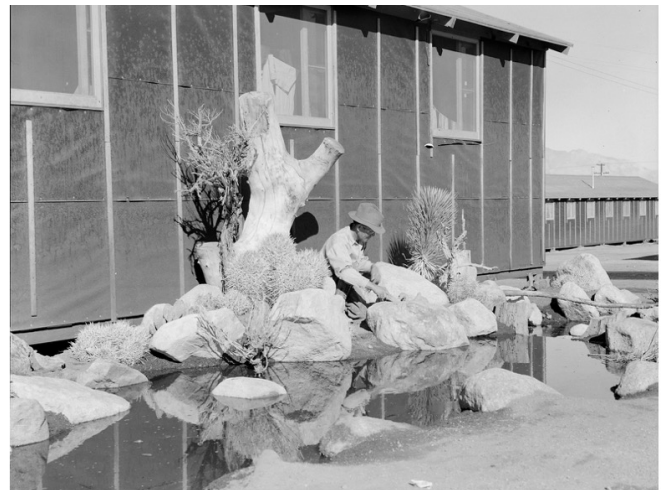
Lange, Dorothea. Japanese American working in garden . 1942. Dorothea Lange Collection, National Archives. Manzanar Relocation Center.