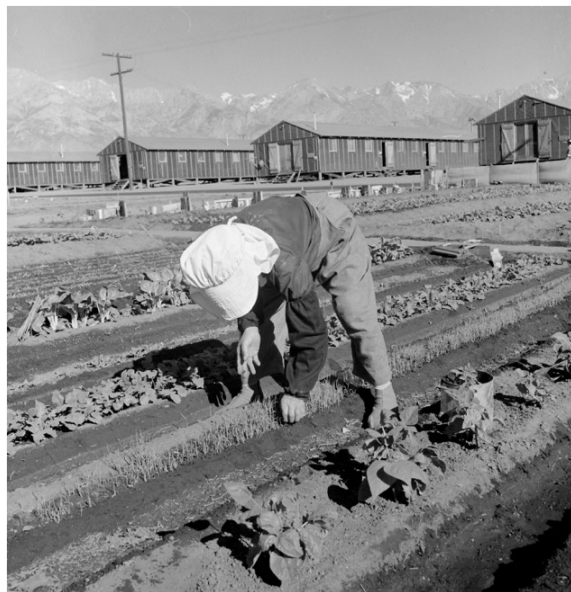
Lange, Dorothea. Japanese American working in victory garden . 1942. Dorothea Lange Collection, National Archives. Manzanar Relocation Center.

variety of produce; the internees took this opportunity to plant Japanese vegetables. The Japanese Americans also constructed thousands of ornamental gardens, ranging in size from parks for all inmates to enjoy, block gardens (a set of barracks were called a block), to small personal gardens. 12 Among these ornamental gardens were traditional raked gravel dry gardens, cactus gardens, showy flower gardens, and ornate rock gardens. The Manzanar internment camp in