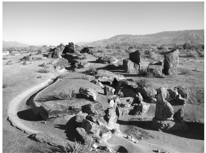
Tamura, Anna. Block 34 garden . 2001. Anna Tamura Collection, Anna Tamura Collection. Manzanar Relocation Center.